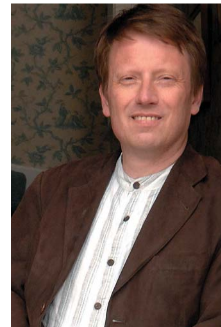
Novelist and critic D J Taylor , whose home is in Norwich, enjoys a countryman's memoir that complements the work of Mary Mann , one of his favourite Norfolk writers.

Alan Clark, by Ion Trewin, is out now in hardback, published by Weidenfeld & Nicolson at £25.